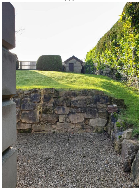
View from the west corner of 4 Greenroyd Court showing 3m elevation to top of garden and neighbours hedge.