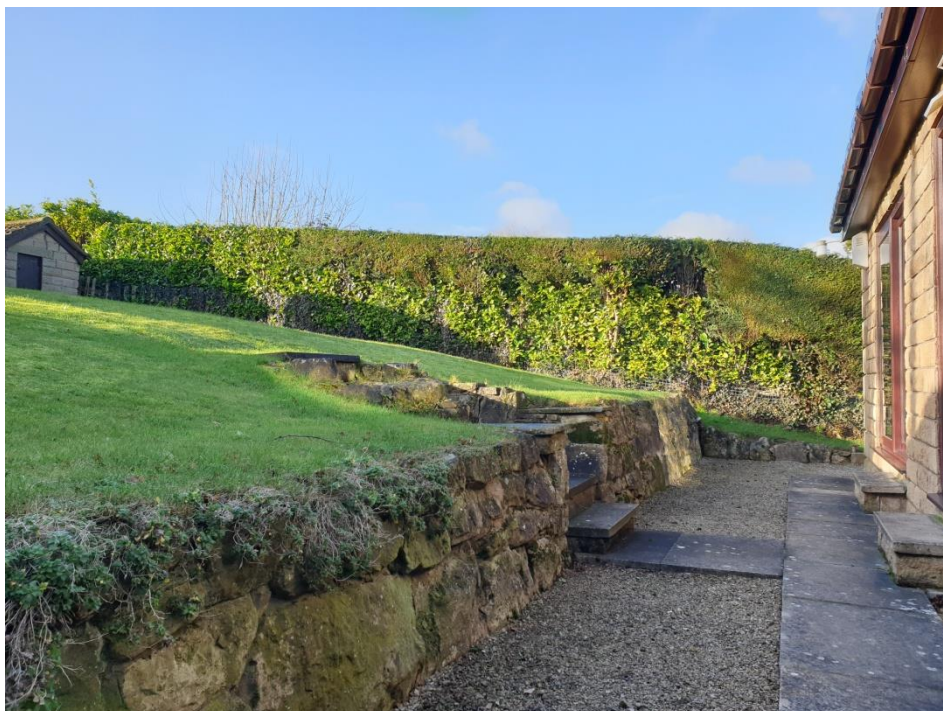
View from 4 Greenroyd Court facing the proposed development which would be total length of my garden.

3. Overbearing - The height and scale of a large two storey house running more than the full length of my garden on top of the elevated position on the slope means the property would have an oppressive impact on my small bungalow which is already 3m below the level of the garden.