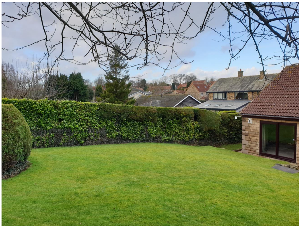
View showing my bungalow 3m below top of the garden and the proposed house position close-up to the total length of the boundary that can be seen causing the removal of the hedge to allow for a narrow path to a door.